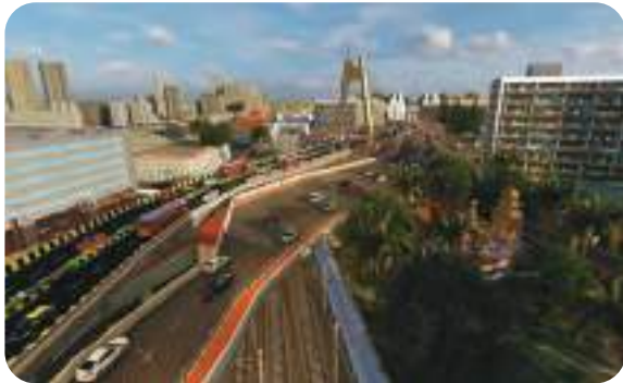
3D representation of proposed Cable Stayed Road Over Bridge near Byculla Railway Station in Mumbai