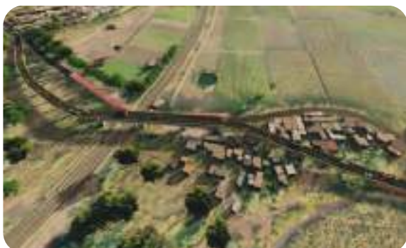
ROB at LC 108 between Borkhedi and Sindi Railway Station on Nagpur - Wardha section of Central Railway