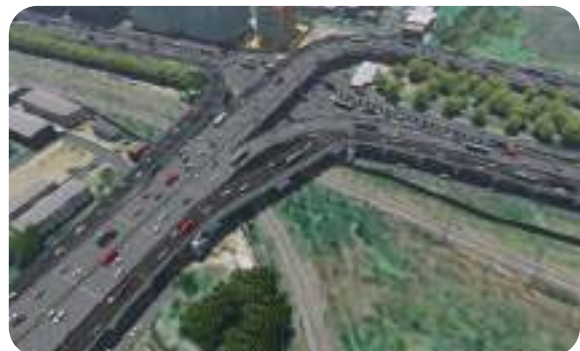
Widening of Turbhe Road Over Bridge on Sion - Panvel Highway in Navi Mumbai, Thane district