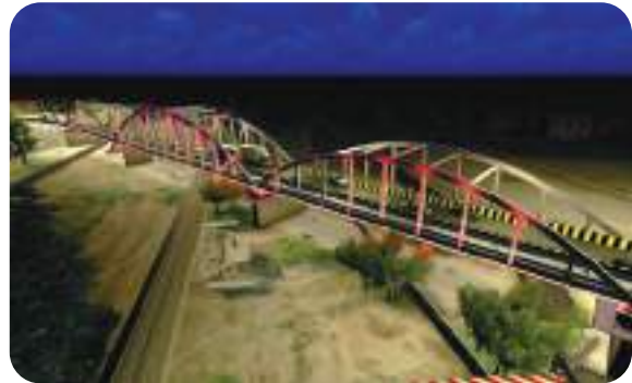
Road Over Bridge (ROB) at LC 144B near Hingoli - Deccan Railway Station in Hingoli district