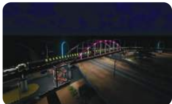
Bow String ROB at LC 548 between Rewral and Tharsa Station on Nagpur - Durg section of SECR