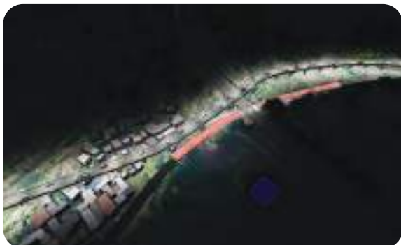
Night view of proposed ROB at LC 465 near Miraj Railway Station in Sangli district