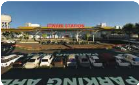
Proposed Multi modal Itwari Railway Station of Nagpur (Itwari) - Nagbhid Gauge Conversion project